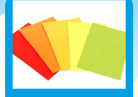
Card Make a jigsaw for your baby using material / cardboard cut out into 4 pieces and encourage them to join back together.