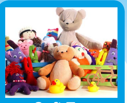
Soft Tov You could use a soft tov instead of a puppet, and make up names, and voices for the diferent characters.

Encourage your baby to copy actions and sounds.