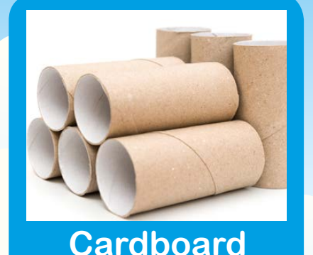
Tubes Use old cardboard tubes, such as from wrapping paper, to make your own puppets by drawing faces / characters on them.