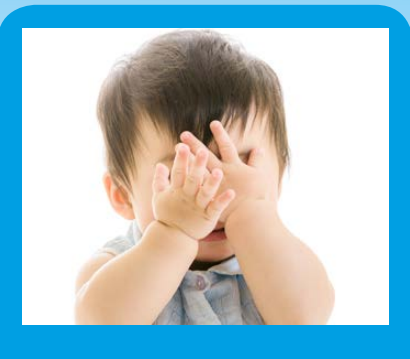
Scarf or Towel With a scarf or towel play peepo with you little one. Hold the scarf in front off you and say "peep po"