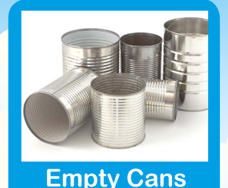
Empty cans can be used to make musical instruments. But be sure to remove sharp lids and clean out thoroughly.