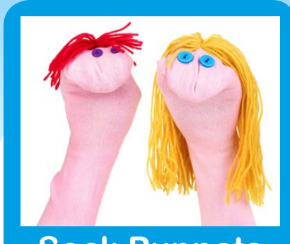
Sock Puppets You can use any sock to make a sock puppet. If you used light coloured socks, you could draw faces on it and put your hand inside the sock and make different sounds.

Copying is an important skill for language development.