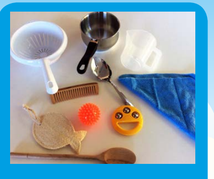
Objects Point to the everyday objects and name them. Let your baby explore the items as you name them. Talking to your baby will help them learn about the world around them.