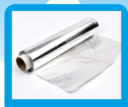
Tin foil If you don't have a mirror you could use a piece of card from a cereal box and cover with foil.

If you have some try slowly blowing some bubbles against the mirror. This is a great way for babies to follow with their eyes, which gives them the opportunity to develop their looking.