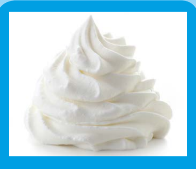
Squirty Cream Make paint by using squirty cream and food colouring.